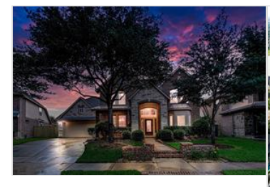
18430 S Settlers Shore is a 3 story home with 4 bedrooms, 5 bathrooms (3 full/2 half), and an attached 2.5-car garage located in Bridgeland of Cypress, TX.