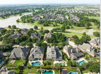
The home sits on an over-sized cul-de-sac lot adjacent to a greenbelt, just a short walking distance to the lake!